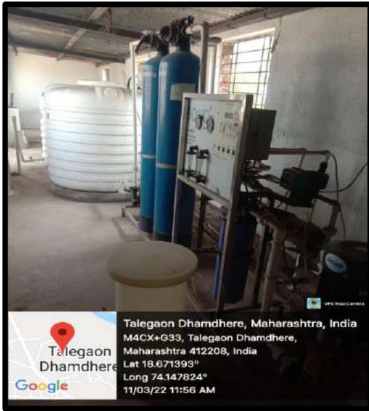
Water Filter Plant